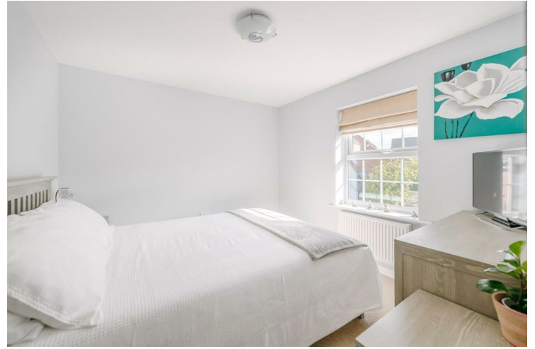
BEDROOM FOUR 11'10" x 8'8" (3.611 x 2.665) A further double bedroom overlooking the rear garden.