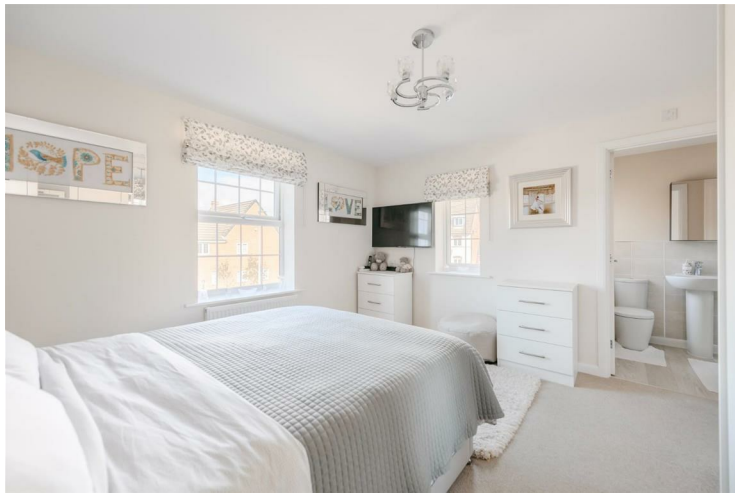
BEDROOM THREE 12'7" x 11'6" (3.85 x 3.525) Overlooking the rear garden.